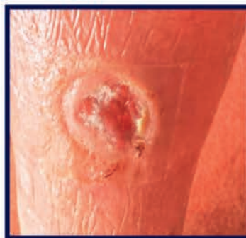
Day 19 of treatment