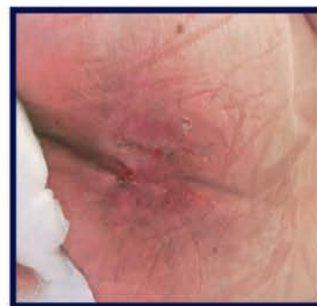
Day 10 of treatment

“The NEXA NWPT System is an excellent product. It has the advantages of being simple to use and inexpensive when compared to other products. Overall, every nurse enjoyed using the NEXA System and the patient, who had experience with other NPWT systems (and hated the thought of using it due to to the alarm constantly waking her) was grateful for the fact the NEXA System did not wake her once, the therapy pump noise did not disturb her in the least and the wound is certainly in a healing state.”