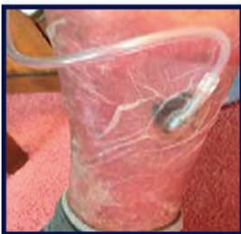
NEXA Dressing in situ

The wound size decreased markedly over the treatment period. At day 39 the wound was too small to continue with the Nexa System. The wound progressed to full closure within the next week using standard wound care.