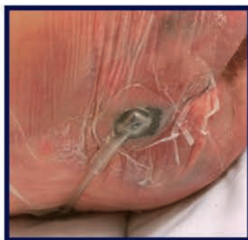
NEXA Dressing in situ