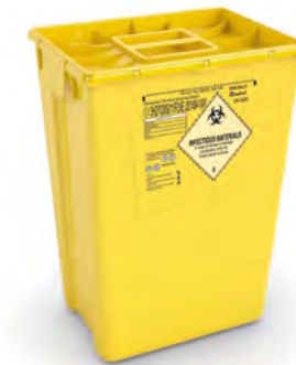
EVO 50 MONO