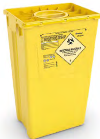
EVO 60 DUO-N