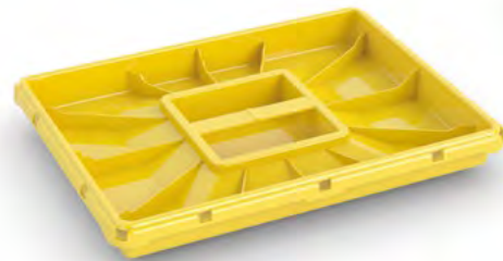
Single lid with adhesive.