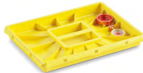
Mono lid with double bi-injected cap for the sterilisation of clinical waste.