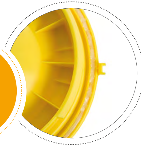
Latex-free adhesive for permanent closure.