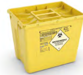
EVO 30 MONO