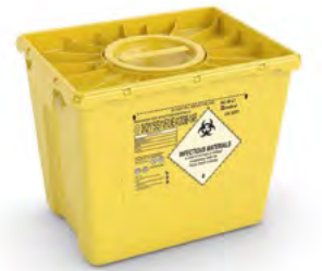
EVO 30 DUO-N