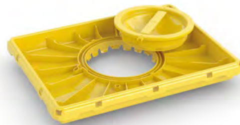
Double lid with adhesive (even in the porthole).