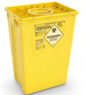
EVO 50 DUO-N